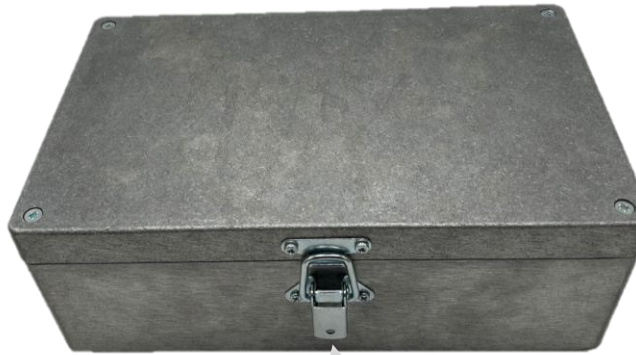
Mechanical Clamping Latch