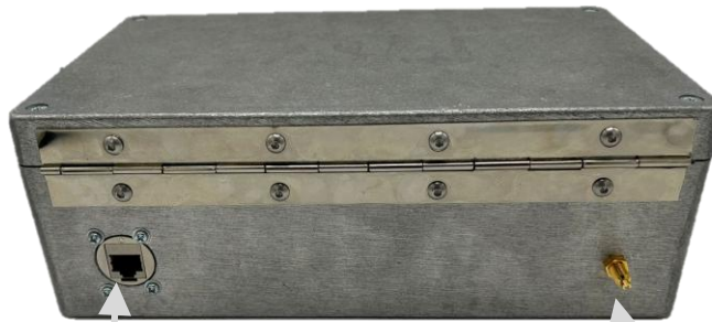
RJ45, SMA, HDMI, BNC or USB Pass-Through Connector